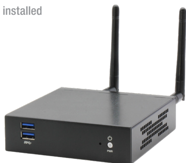
With Antennas installed